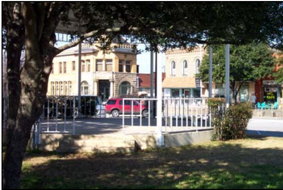
North side of "The Historic Square"

HISTORIC DOWNTOWN - Laid out on Christmas Day, 1853, and established in January 1854 much of Pilot Point's heritage is still visible. The oldest brick building in Denton County, built in the early 1870's, is located on the northwest corner of the downtown Pilot Point historic square.