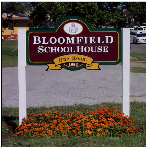
LIVING A DAY IN HISTORY

As one of a very few remaining historic one-room school buildings, it is dedicated primarily to providing a living, one-room, early 1900's educational experience. Tours are available by appointment for all days or times.