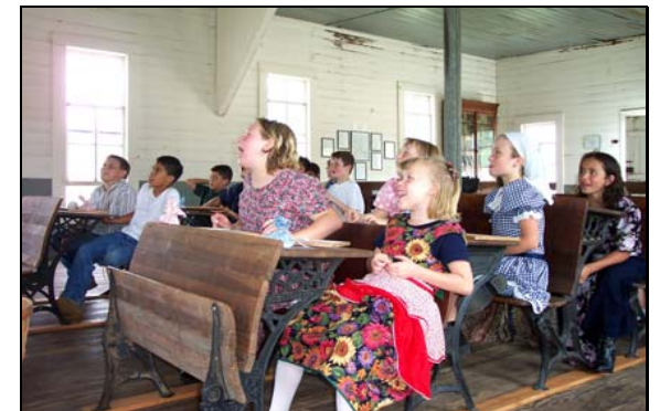
Attention Boys and Girls

To keep cool, children would splash themselves with fresh water, and then play outside as long as possible. Nearby shade also helped.