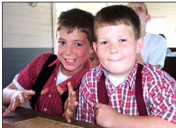
"Tom Sawyer and Huckleberry Finn"

This building, built in 1883, and was originally located five miles northwest of Pilot Point and west of Isle de Bois Creek State Park. In the spring and fall, local school districts send fourth graders to the Bloomfield School for a true pioneer experience, as students are exposed to what education was actually like a century ago.