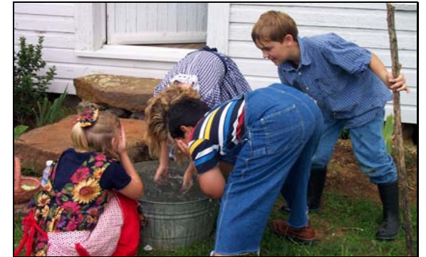
Cooling Off in the Wash Tub

room and children sat around it in cold weather to keep warm. Two students were assigned to cut the wood for the stove. A stick would be placed through the handle of a bucket that allowed two children to carry it from Odie Wester's house some 200 yards away, where it was stored.